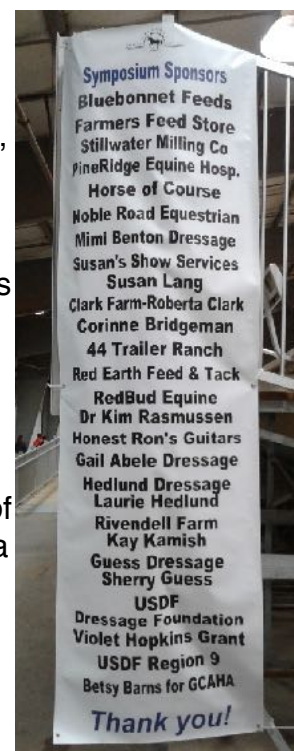
Thank You, Symposium Sponsors!